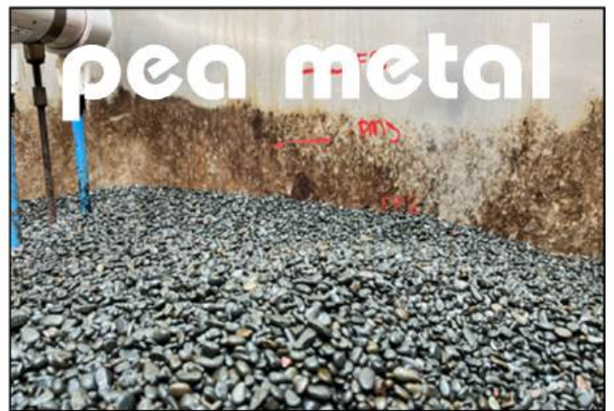
4. Supply pea metal