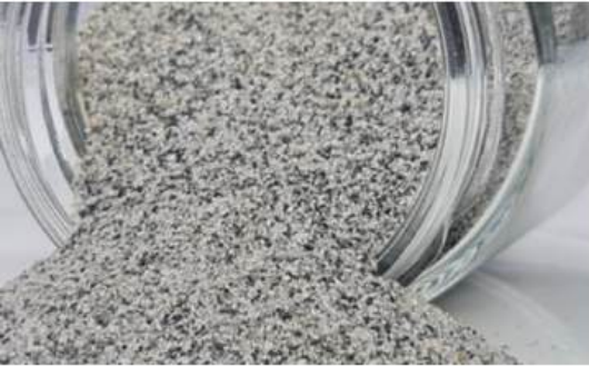
super fine sand - perfect for artifical turf