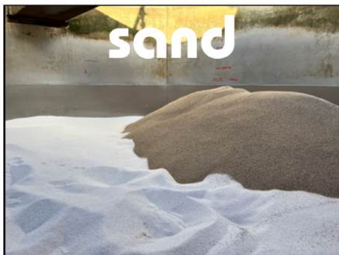
5. Supply sand media