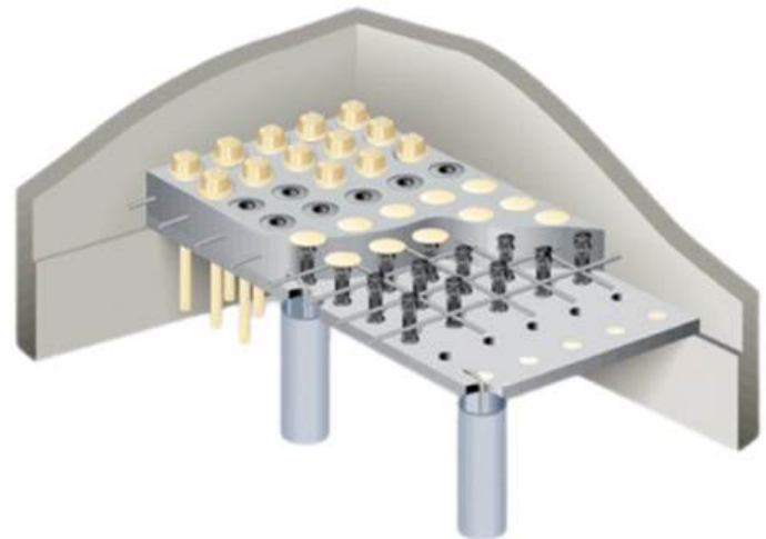
monolithic flat panel filter floor