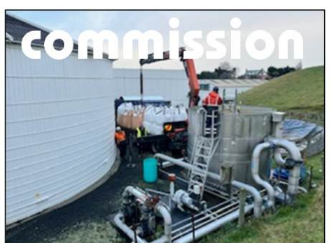
6. Test and bring filter online