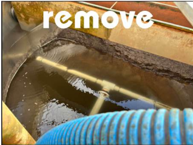
1. Remove old filter media.