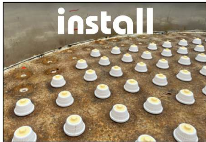
3. Clean filter, supply and install nozzles