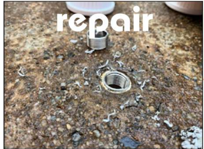
2. Repair or rebuild the filter.