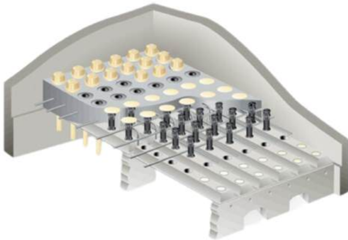
monolithic corrugated panel filter floor